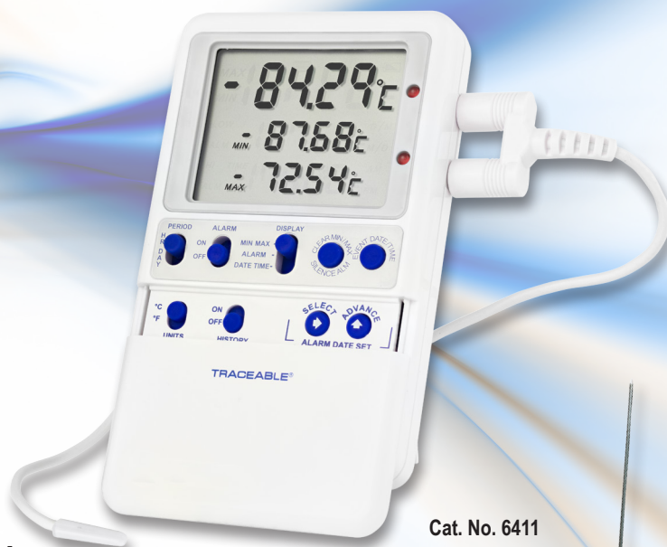
Cat. No. 6411